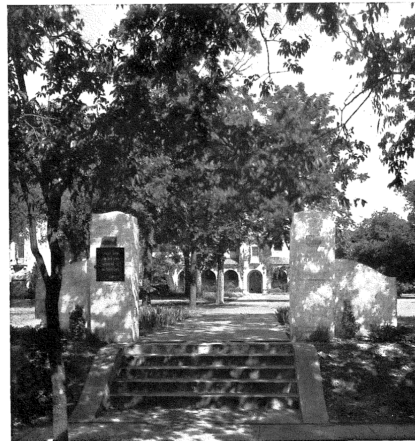
Rollin Thomas Chafer Memorial Gate